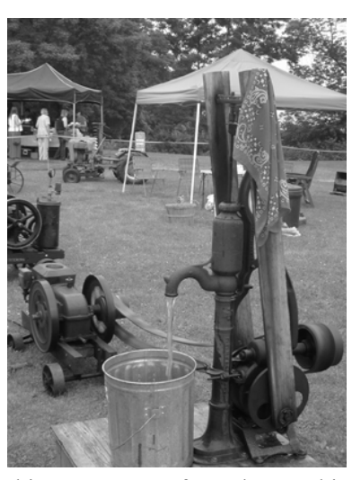
This water pump from the Maybie farm has been adapted to run by belt and could easily water the 125-head dairy herd.