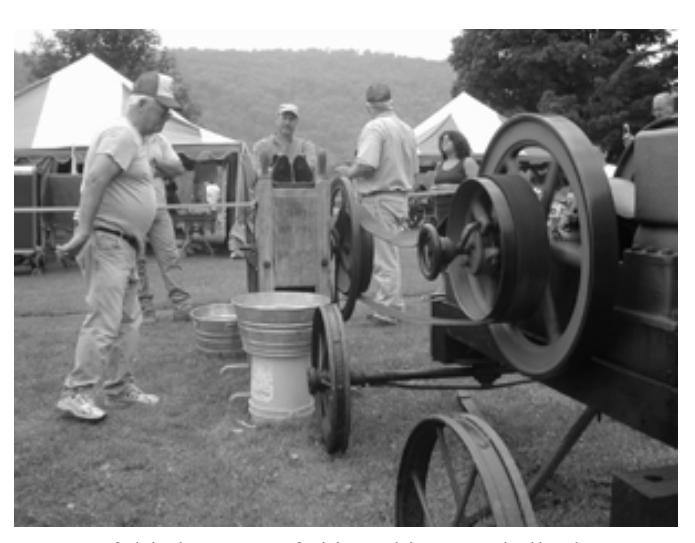
Ears of dried corn are fed into this corn sheller by my father, and the individual kernels are removed from the ears.