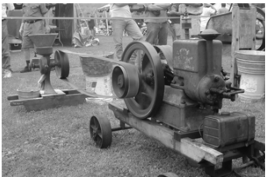
This corn grinder takes the individual kernels of shelled corn from the machine pictured above, and crushes it to make cracked corn for livestock.

Of equal interest, however, are some of the local machines that were driven by these hit and miss engines. There is a house just east of the firehouse off 990V in West Conesville that in the early part of the last century was a barrel maker's shop. The building housed a hit and miss engine, shapers for staves, and a barrel top maker that we are now restoring. Other area business used machines to separate cream and churn butter in the creameries; to turn blades and stones in mills; and generally to turn the wheels of many area businesses.